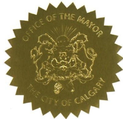
JYOTI GONDEK MAYOR